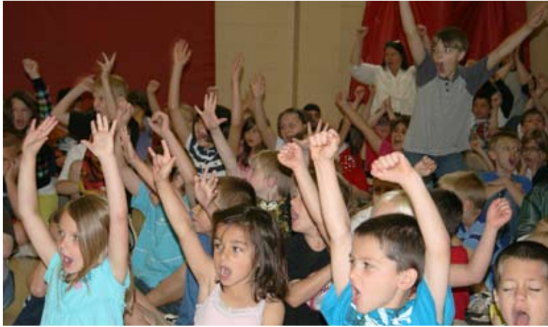
Students are active participants in celebrating Fox Elementary School's SSOC banner presentation in Arnold, Missouri. The school is also a CEP Profiles in Character award winner.